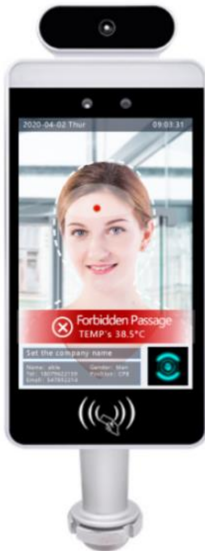
IC card / ID card